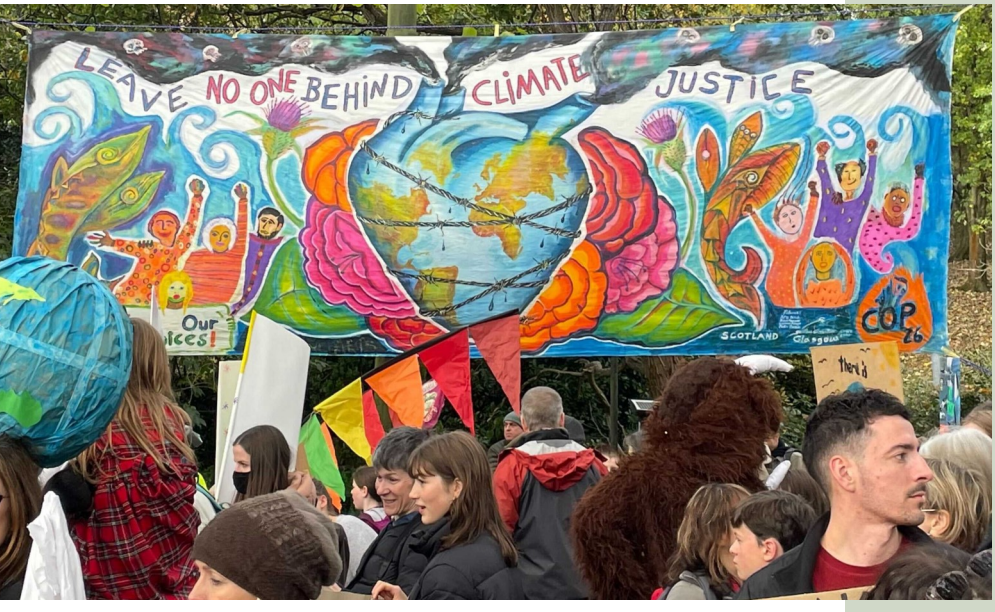
Massive protests applied pressure on negotiations and provided hope.