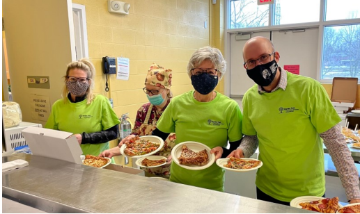
Serving pizza on Pi Day at Stanley Park Community Centre with just a few of their many dedicated volunteers.