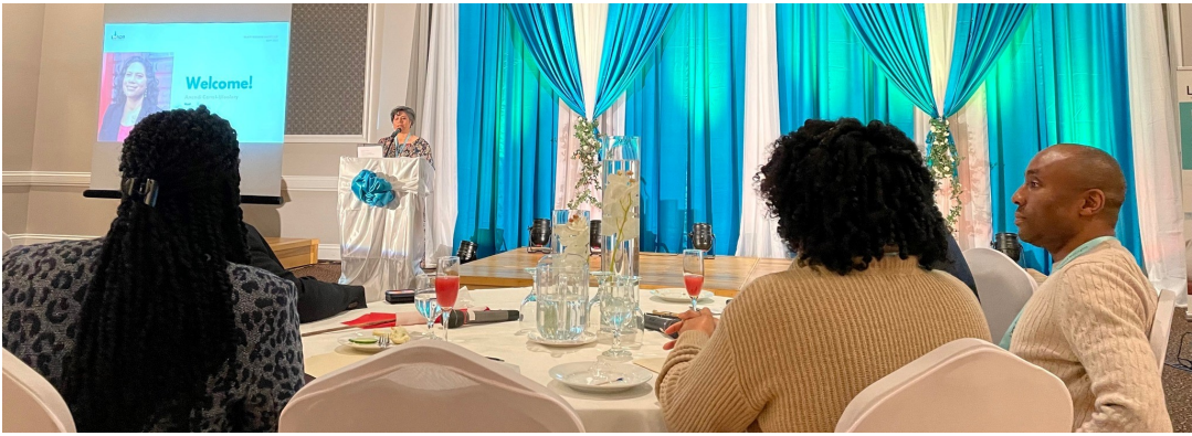
Inspired by the first cohort of Black entrepreneurs at LiftOff by the Caribbean Canadian Association of Waterloo Region at their Black Business Showcase.