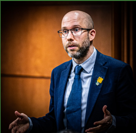
"If it is not a silver bullet, why are we giving them $50 billion for it?"

The federal government unveiled their Emissions Reduction Plan (ERP) - which included billions in a new subsidy for fossil fuel companies—just days before the International Panel on Climate Change released their latest report with a stark warning, "It's now or never". Since then, I've been pressing the government to heed the calls from climate scientists and the UN Secretary General, who called actions like those of our government "moral and economic madness". Subscribe to my YouTube channel to see all of my speeches in the House.