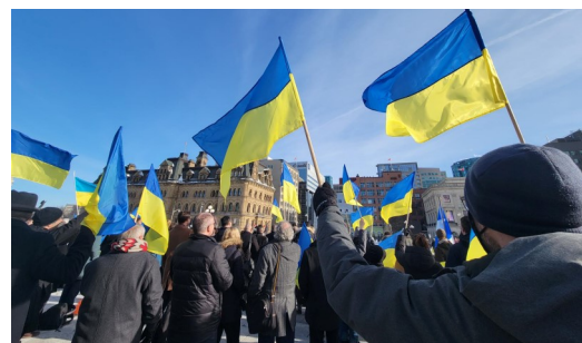
Attending a cross-party rally for the people of Ukraine and their loved ones in Canada in front of the Parliament buildings.