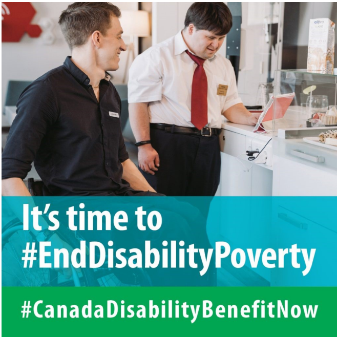
Disability Without Poverty has been a leader in national efforts to bring a Canada Disability Benefit to reality.

I continue to advocate for the federal government to fast-track the Canada Disability Benefit, which would be an essential lifeline for as many as 1.5 million Canadians living in poverty.