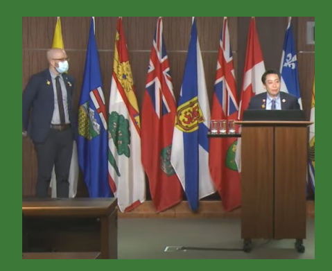
Raising concerns about anti-trans hate in Canada on May 17th, International Day Against Homophobia, Biphobia, and Transphobia.