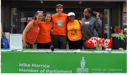
Wearing orange on July 1 to raise awareness and show support for Indigenous neighbours impacted by residential schools.

I was honoured to paddle in Two Row on the Grand, with one Indigenous row, and one ally row – to demonstrate the simple concept of the Two Row Wampum Treaty.