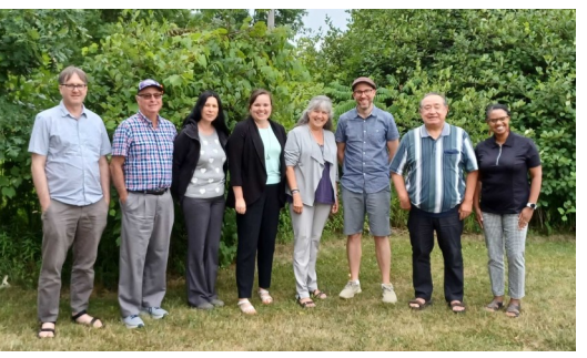
Meeting with Six Nations of the Grand River to discuss challenges with various governments not respecting their duty to consult on developments.