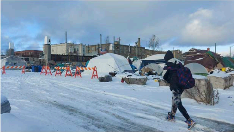
Victoria Street encampment in Kitchener, winter 2023.