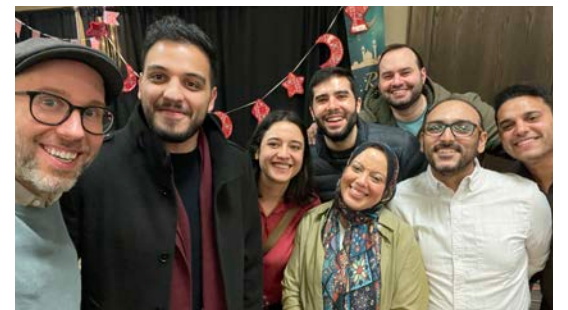
Hearing from local business owners at Live with SWAY's Ramadan Market.