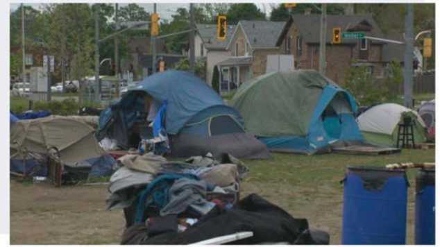
The Weber Street encampment in Kitchener in November 2024.

By Shelby Knox Published: January 22, 2025 at 12:36PM EST