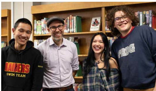
Answering questions from KCI students and teachers.