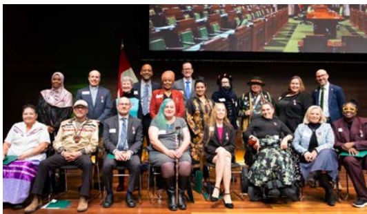
Awarding 20 community leaders with the King Charles III Coronation Medal.