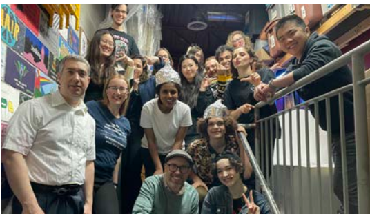
Joining FASS for a cameo in their latest production at KW Little Theatre.