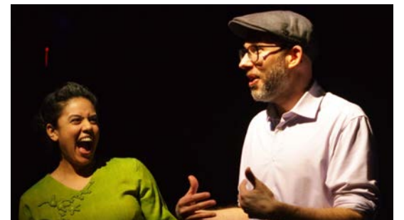
Kicking off MT Space's Works-In-Progress Mini Festival.