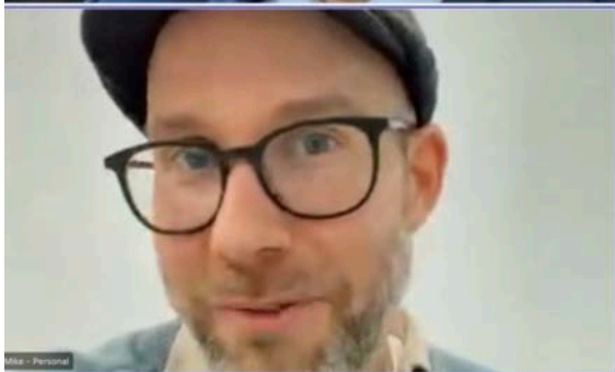
Mike chats with Minister of Housing and Infrastructure Nathaniel Erskine-Smith